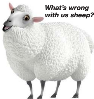
What's wrong with us sheep?