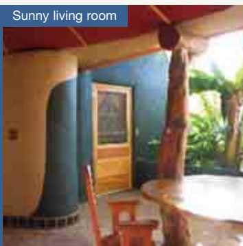
Sunny living room

For more information and how to contact us, go to www.lowcarbon.co.uk